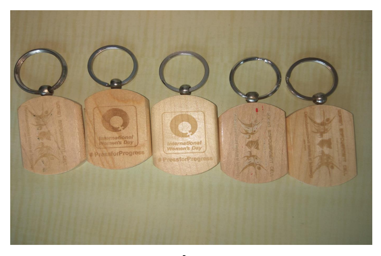
A sample of Memento -Key chain [For Girl students]