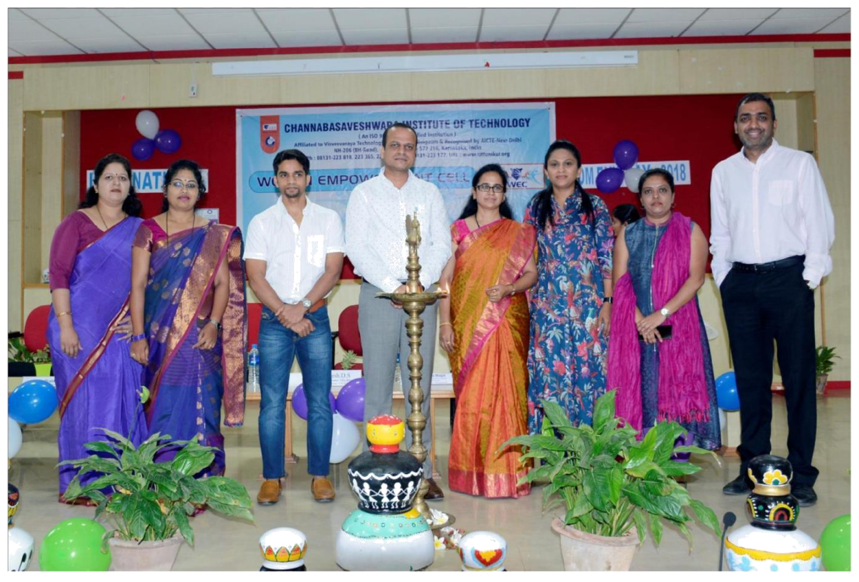
Inauguration of International Women's Day 2018@CIT Campus