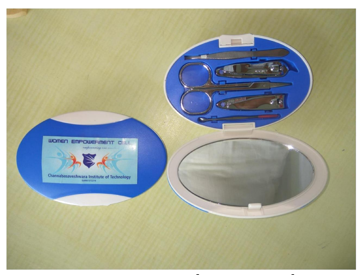
A sample of Memento -A Manicure Kit [For all Female staff ]