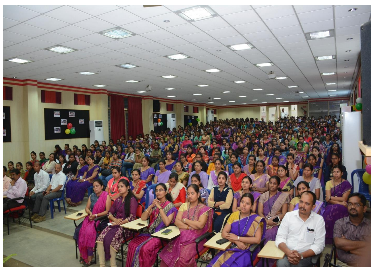
Lady Faculties and Girl students with purple color costume- it symbolises dignity and justice.